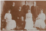
Shown in 1907, the Bon Marche staff was a group of young men and women. They were the first to be open at 12 High, and by the time the clock struck 6 p.m., there had been 100,000 customers. The store was the first to be open at 12 High, and by the time the clock struck 6 p.m., there had been 100,000 customers.