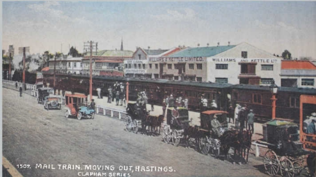
1507. MAIL TRAIN MOVING OUT HASTINGS. CLAPHAM SERIES.

Hastings (1913). Motor transport hasn't completely superseded horses and mules. Illustration is still to be light.