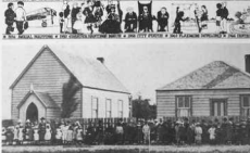
1870 and the first school, opened in St Andrew's four years earlier, is getting reconstructed. Soon Central School will open on the site behind the old school on Southporton St.

DEPARTMENT OF TARIKING 1840-1940 DEPARTMENT OF TARIKING 1840-1940 DEPARTMENT OF TARIKING 1840-1940