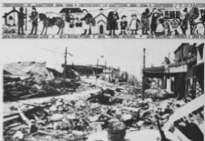
Sheltering in west, between Nelson St and King St, after the 1931 quake. "In how time that it can be laid, the down spreading of stones was utterly out done, as though the structures had been earthquake," one Hastings resident wrote.