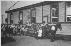
IBR: The influenza epidemic was so great that Mableton School was disrupted with ferocity.