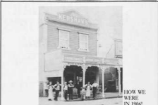
HOW WE WERE IN 1966!