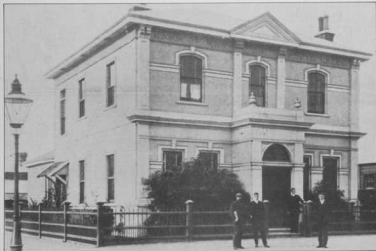
The original premises in the corner of Hastings and Market Streets, established 1884.

The bank in 1915. The bank in 1915. The bank in 1915. The bank in 1915.