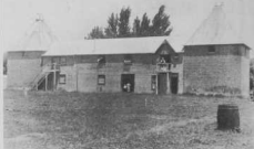
The new home in the Riverside Hop gardens. The Masters family live in the main block. Lane is between a nursery school and a school.