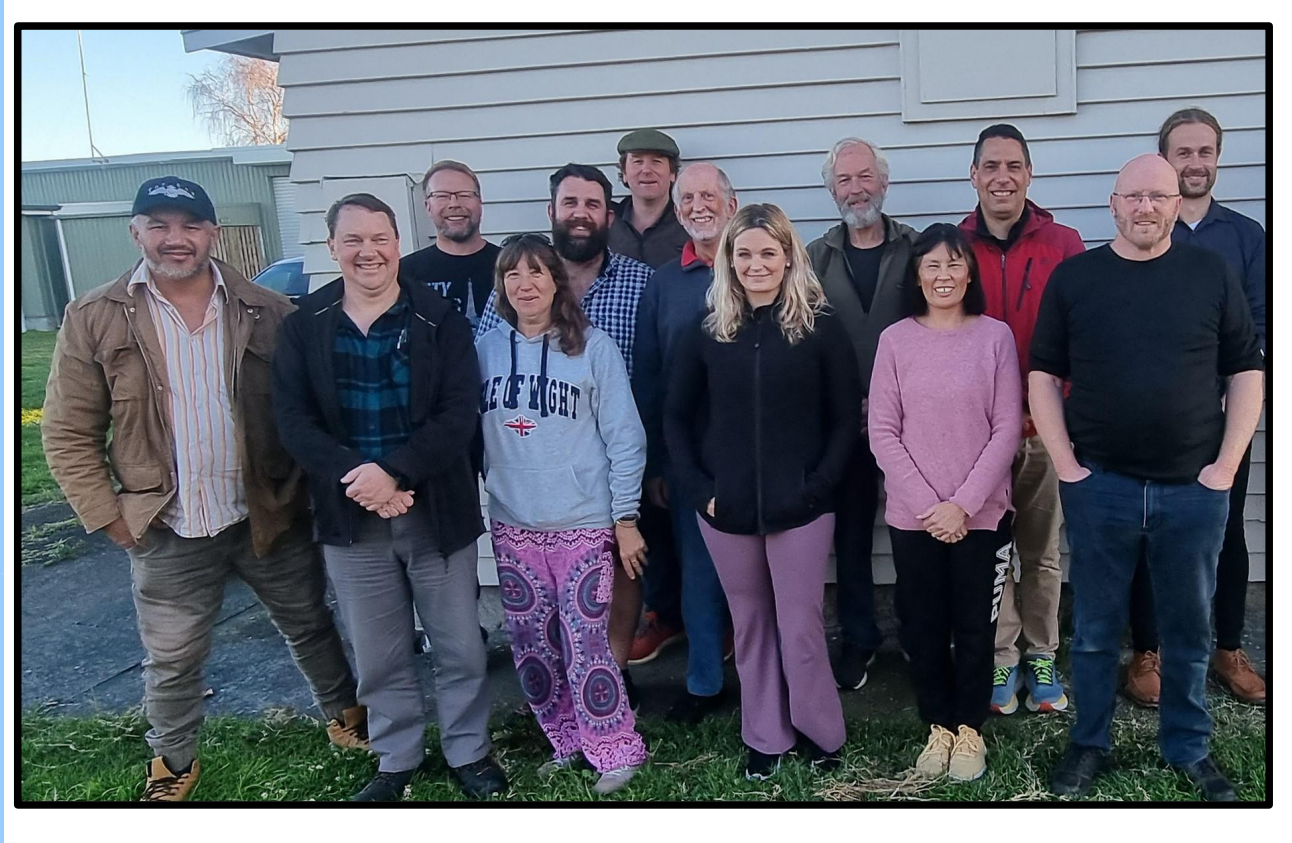
A huge welcome to the 14 new Hams from the Hawkes Bay Ham Cram Well done!!!