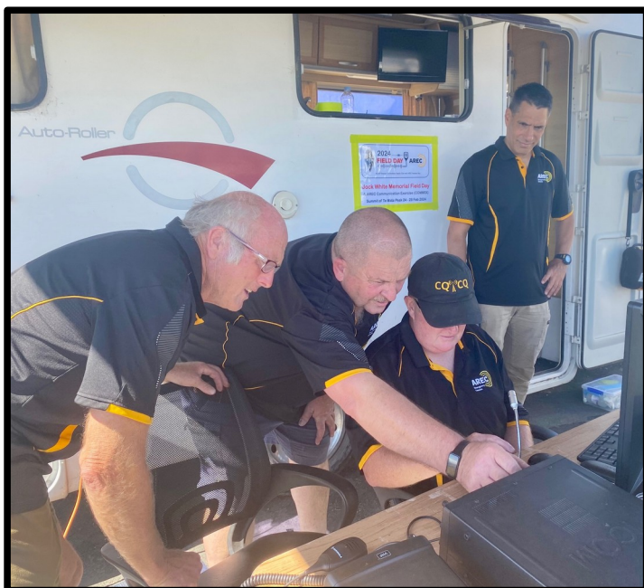
The set getting turned on and the boys getting tuned up ready to go