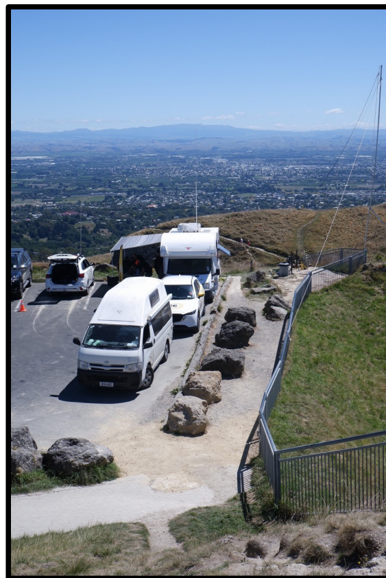
A couple of pics of the setup - another horrible HB day ...