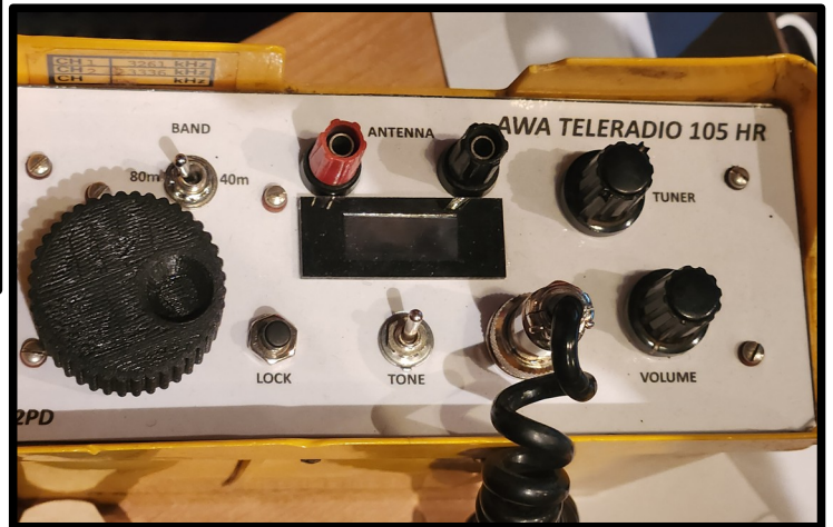
The Butter Box radio