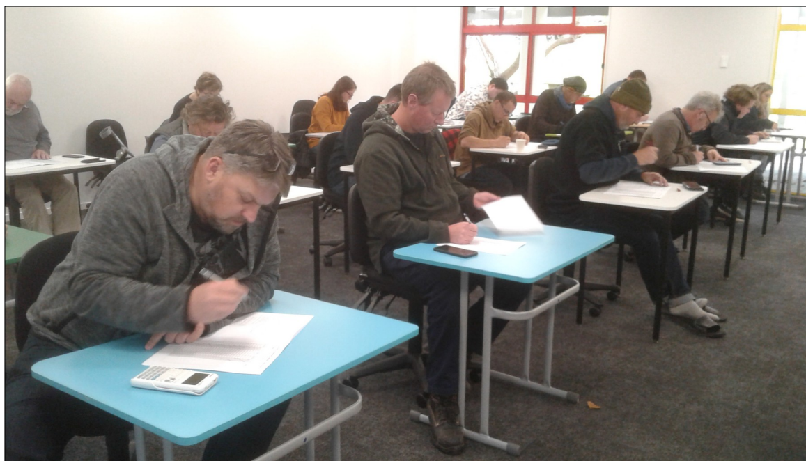
Ham Cram candidates doing the exam at Napier on 16 June 2024. 18 out of 19 passed.