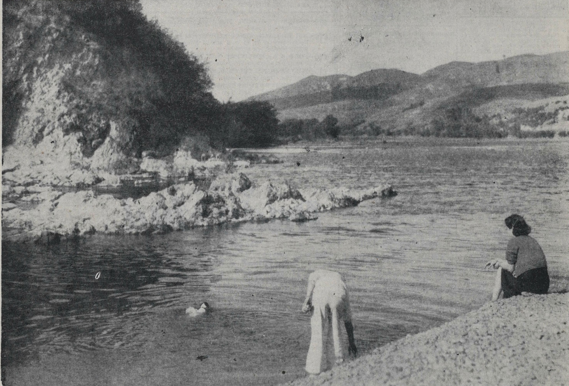
FAVOURITE PICNIC SPOT.—Near the famous "Horse Shoe Bend," on the Tuki Tuki River, Hawke's Bay. Pleasant willow-fringed banks and a splendid "swimming hole" attract crowds of holidaymakers to this spot during the summer.

Announcing THE YEAR'S MOST OUTSTANDING MOTION PICTURE!