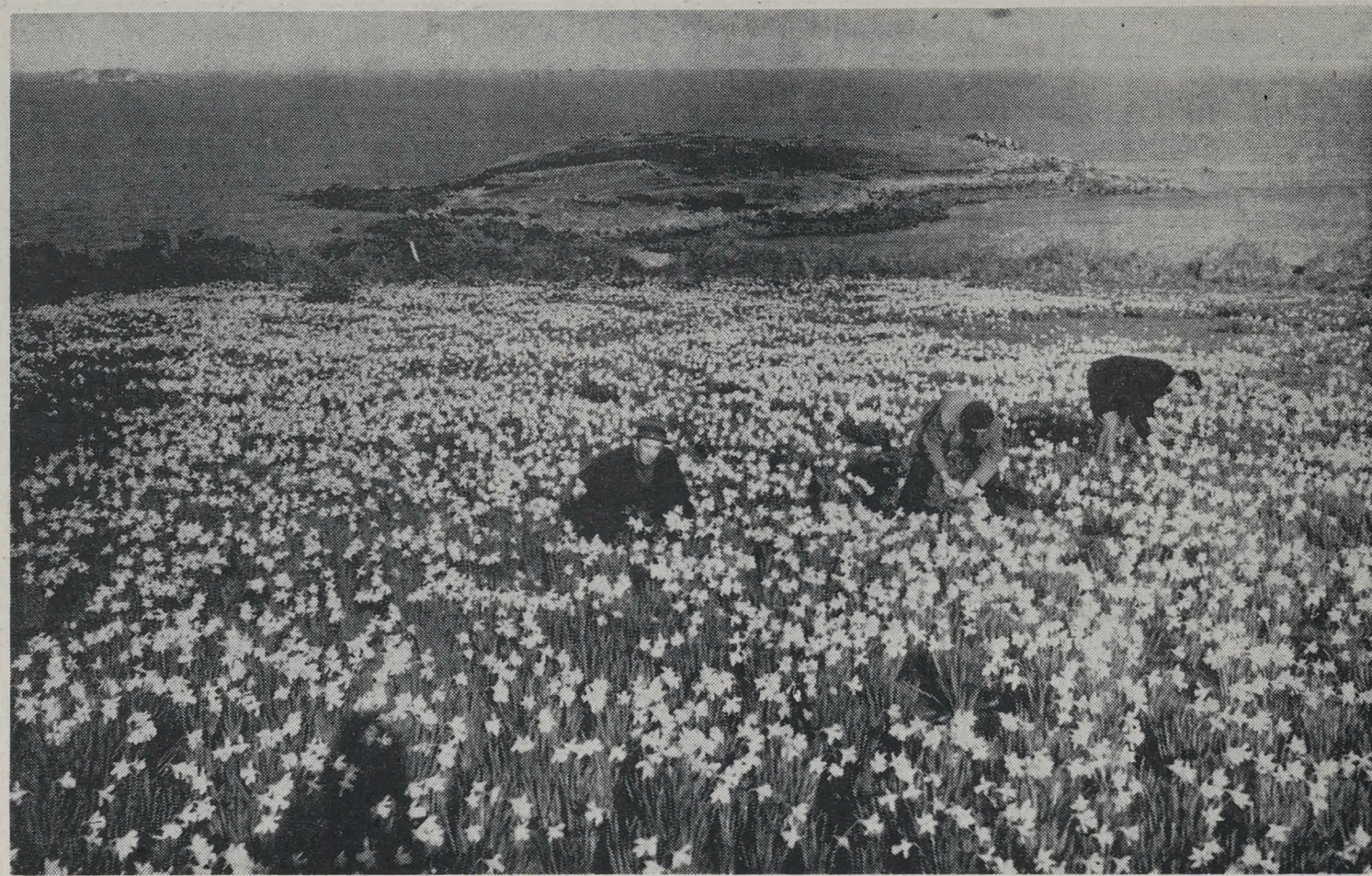
THE FLORAL ISLANDS.—Daffodil time on Plistry Farm in the Scilly Islands. Plistry Bay is seen in the background.