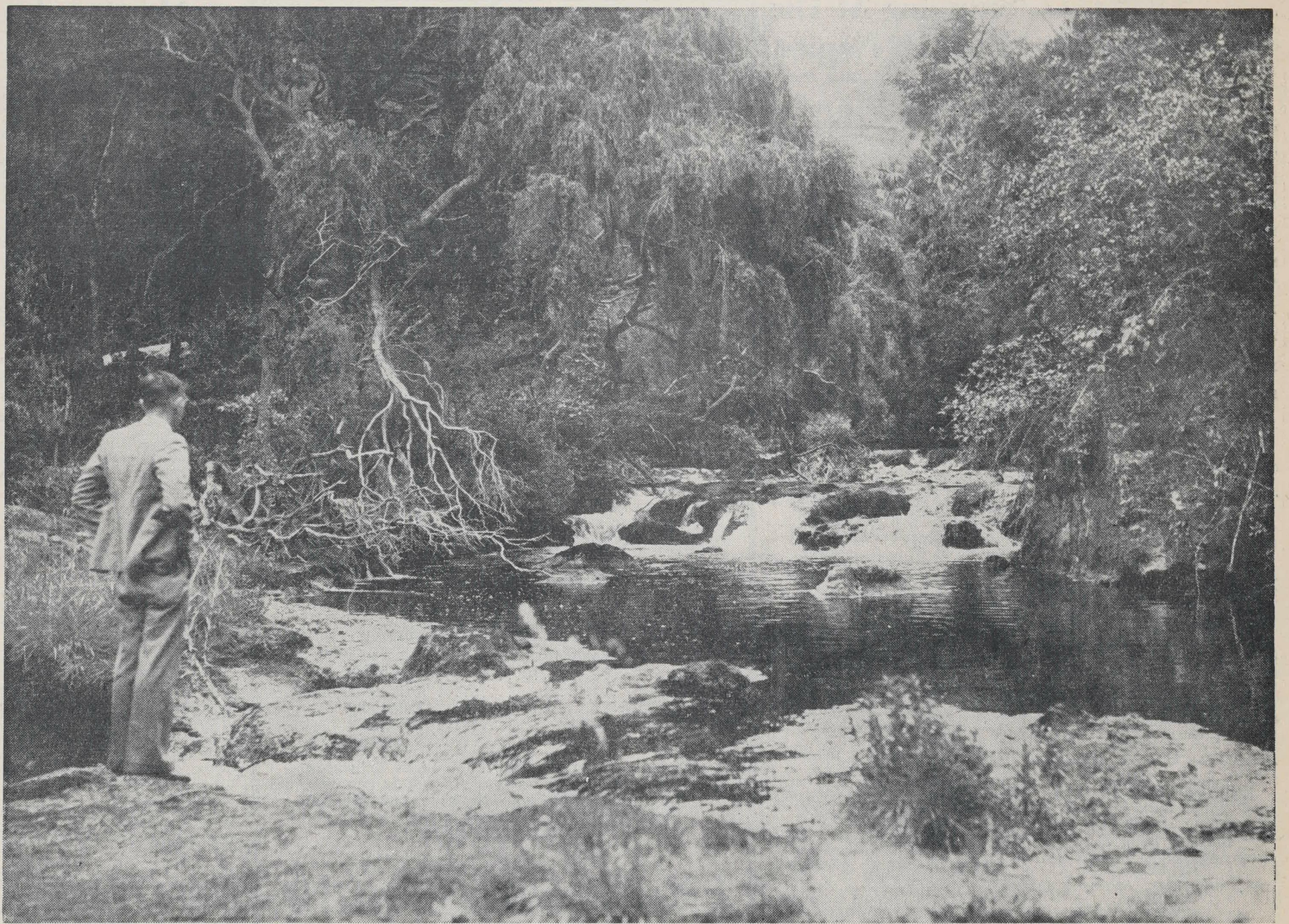
BEAUTY OF THE HAWKE'S BAY COUNTRYSIDE.—An arresting beauty spot on the Maratotara Stream, two miles from the Waimarama Road.