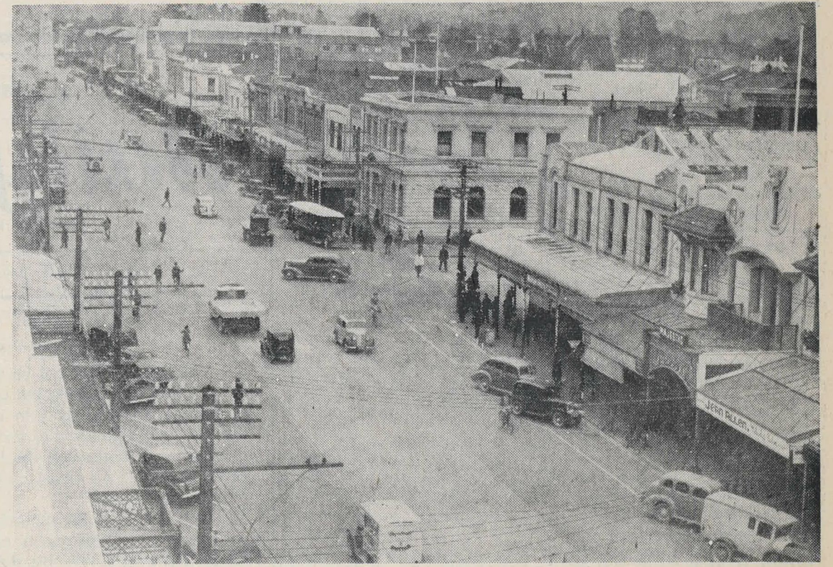
BUSINESS CENTRE OF GISBORNE.—The intersection of Gladstone Road and Peel Street, here shown, may be described as the busiest part of the thriving town of Gisborne.