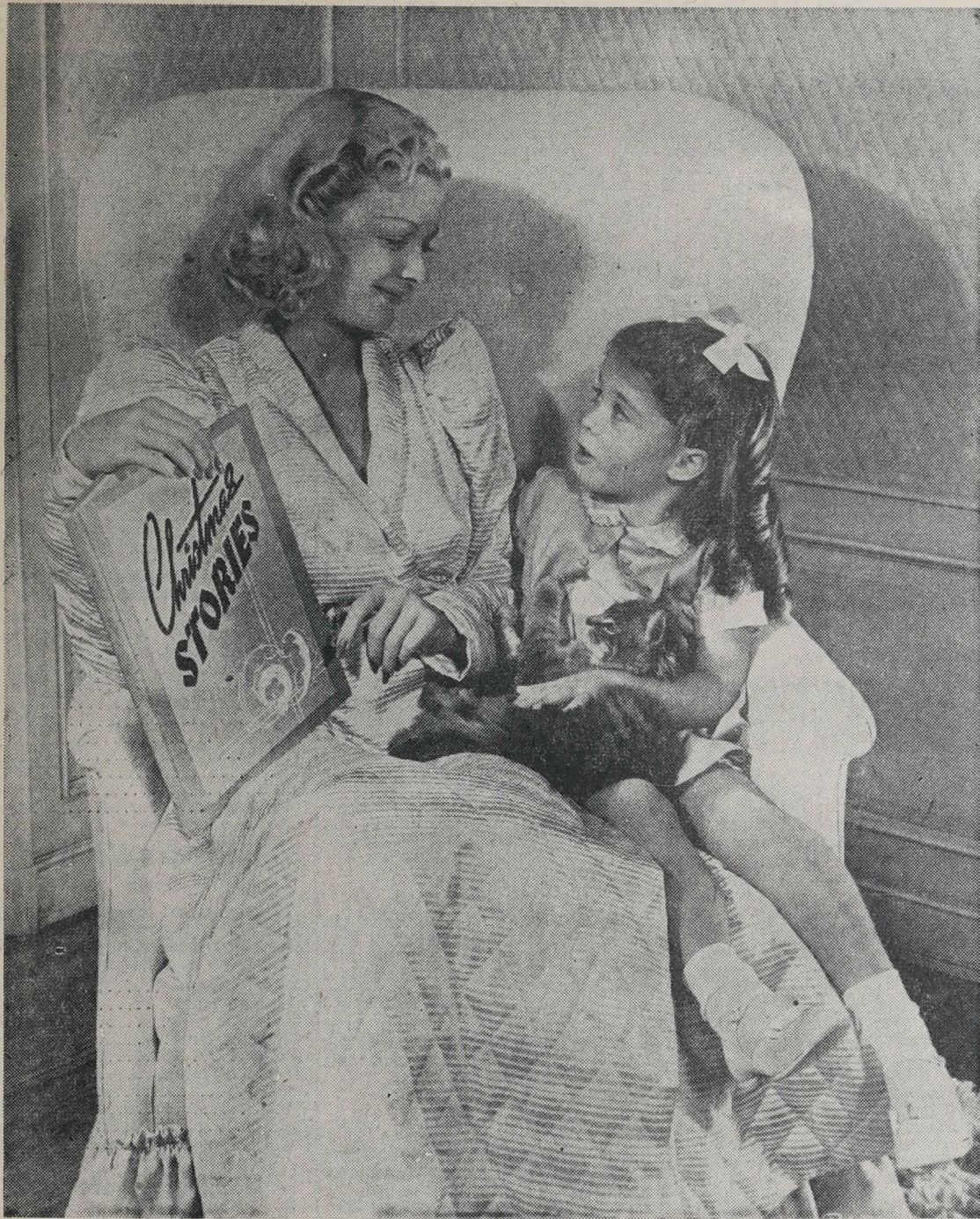
CHRISTMAS IS COMING.—The popular film star, Joan Bennett, with her little daughter, the family cat and a Christmas book. Film stars generally have side chimneys so that Santa Claus will have little trouble.