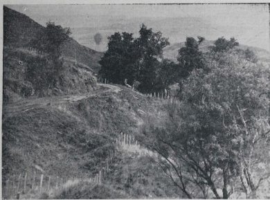
TYPICAL SCENE AMID THE HILLS SURROUNDING THE NAPIER FUR FARMS. This view was taken from the top of Darby Spur, a well-known landmark on the road between Makarewa and Karaka.