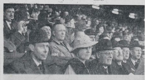
INTERNATIONAL BURY, ENGLAND v. SCOTLAND, SCOTLAND WINS THE CALCUTTA CUP AND THE BIRCH CHAMPIONSHIP BY BEATING ENGLAND, 11 POINTS TO 5, AT TWICKENHAM. The King and Queen in the Royal Box watching the game.