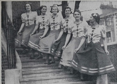
NATIONAL DANCE COSTUME —For many years the English Folk Dance and Song Society has been concerned with the problem of a design for a dress specially suitable for English folk dancing. Finally a "national dance dress" has been decided upon. Dancers wearing the new dresses, which will be in many colors.