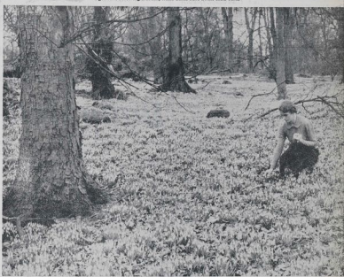
ON VIEW FOR CHARITY —The woodlands of Moss Hill, on the East of Dunfermline, Scotland, are now thickly carpeted with snowdrops in full bloom. Considered to be one of the finest displays in the country, they are on view to the public each Sunday, and the proceeds from the small admission fee goes to charity.