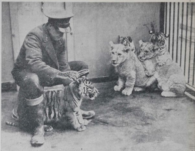
"RAVE NIGHT" FOR THE CUBS —Any time is high time for the six-month-old lion cubs and tiger cubs which are being brought up together at the Dudley Zoo. The zoo is in the grounds of Hensley Hall and belongs to the Duke of Dudley. The photograph shows one of the tiger cubs receiving a kiss, while other cubs await their turn.