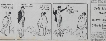
Cartoon illustration for Like Its Advocate, This Scheme Won't Work.