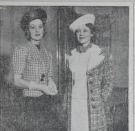
Flower Girl and Page Boy.

The bride and groom... The ceremony was held in the morning at 10.30.