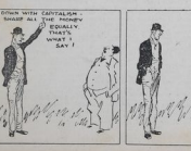
Cartoon illustration for Talking Shop.