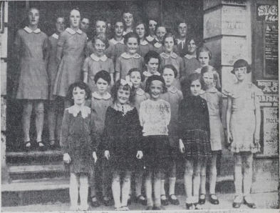
ANNUAL COMPETITIONS CONTINUE IN NAPIER. —The Rowland House choir, and other competitors, engaged by the "Daily Mail" coverages outside the Purver's Hall, Napier, where the competitors are being held. They entrance the women.