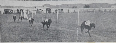
GREYHOUND RACING ASSOCIATION'S EASTER CARIVAL. —The finish of one of the races at Napier on Saturday. The meeting was very successful and the track record was broken.