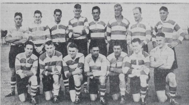
THE HASTINGS CELTIC TEAM WHICH BEATED WANGANUI MARISTS IN THE SHILLING TOURNAMENT OPENED AT NAPIER ON SATURDAY. —Hastings won by 12 points to six and enter the final to be played tonight.

"After this round, I'm going to meet Bill for a DEWAR'S..."