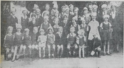
SCHOOL BIRTHDAY PARTY—A photograph taken by the "Daily Mail" cameraman at the Xaver College School when a birthday party was held.