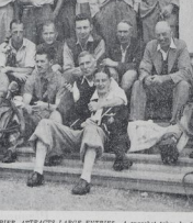
NAPIER MAGNET. From left to right: Captain, ...