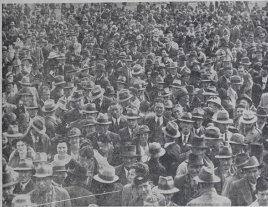
A GENERAL VIEW OF SPECTATORS AT THE WAIPUKURAI RACE MEETING YESTERDAY.