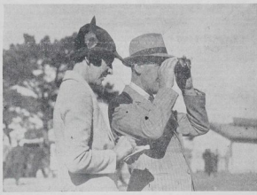
SNAPPED BY THE "DAILY MAIL" CAMERAMAN AT THE WAIPUKURAI RACES YESTERDAY.