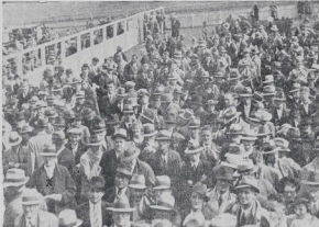
ANOTHER GENERAL VIEW OF A SECTION OF THE LARGE CROWD AT THE WAIPUKURAI RACE MEETING.

MEN'S FINE RATS. An outstanding bargain. Best new shape in all colors. Woolen Grey, Fawn and Green. All sizes. B.M.L. PRICE 2/11 Each. MEN'S MERINO WHEAT MINTY LINEN-BLENDED. Don't wash in hot water before. Good for all seasons. B.M.L. PRICE 2/11 & 2/11 Garment. MEN'S OILED CANVAS RAINCOATS. You're sure to avoid any of them. This season. Waterproofed, damped, double breasted, shoulder flap, and Water tight seams. You can be sure of being warm dry. Woolen . All sizes. B.M.L. PRICE 2/6 & 3/0.