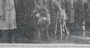
ANZAC DAY SERVICE - a section of the group of men in uniform at the Anzac service before the laying of the wreaths and the sound of the Last Post.