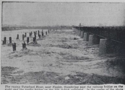
The reason Pukekohe River, near Napier, overflowing past the railway bridge on the right and the bridge bridge on the left, which collapsed. In the centre of the photo can be seen the jobs of the old bridge.