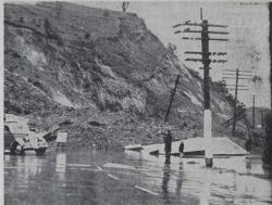
Thousands of cubic yards of soil covered the slip which completely blocked the corner of Hylton's Road and Parahi Road. Slips, badly reaching the houses on the far side of the road.