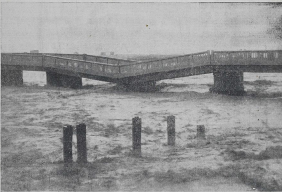
SPAN IN MAIN ROAD TRAFFIC BRIDGE NEAR NAPIER EN ROUTE TO HASTINGS CRASHED BY FLOOD.

There were many families falling on the roads, and many persons were injured. The main road to Hastings was closed, and the main road to Hastings was closed, and the main road to Hastings was closed.