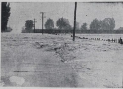
The road to Pukekohe, where settlers have been driven from their homes to take refuge in the school, was heavily scored by the rip of the flood. A view of the flooding water.