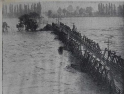
The Parahi bridge almost obliterated at the onslaught of flood water which quickly inundated this area. Drains average six feet deep, has been done at Parahi.