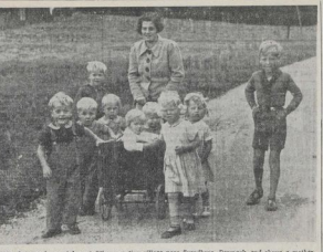
This photograph was taken at Gilroy, a city 40 miles west of Hastings, and shows a mother taking her family for a drive. The family members wear and include three sets of twins.

They are a good choice for the garden. They are a good choice for the garden. They are a good choice for the garden.