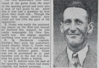
S. Mackenzie, New Zealand polo player, who won the Australian Gold Cup polo tournament, defeating New South Wales today.

Used Press Association—Copyright. (Received April 25, 10 p.m.) SYDNEY, April 25.—Giving a superb exhibition, the New Zealand polo team won the Australian Gold Cup polo tournament, defeating New South Wales today. He said that the New Zealand polo team won the Australian Gold Cup polo tournament, defeating New South Wales today.