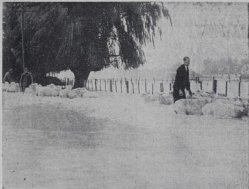
Man in this flood had to wade for three days while battling the way along the road between Hawke's Bay and Napier. This area was trapped of the stockmen necessary everywhere as the water rose.