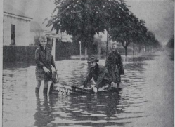
Acting the opportunity to find out a home-made mouse in a Hylton's street within a few blocks of the centre of the town.