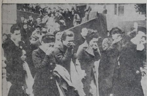
THE DEATH OF KEMAL ATATURK —Turkish men and women weeping as they bury the Dulma Begim Palace at Istanbul, where Kemal Ataturk lay in state.