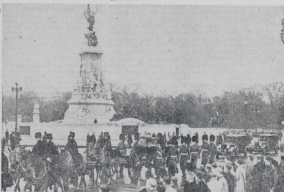
QUEEN MARY'S LAST JOURNEY —The funeral procession of Queen Mary passing the Queen Victoria Memorial outside Buckingham Palace. The coffin was carried to Jersey by a British battleship.