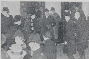
Mrs CHAMBERLAIN LEAVES FOR PARIS —The British Prime Minister (Mr. Neville Chamberlain) is seen on the right, with Lord Balfour (left) and Mrs Chamberlain (center).