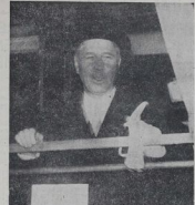
AMERICAN AMBASSADOR LEAVES GERMANY —Mr. Hugh Wilson, shown here by President Roosevelt, crossed a worldwide ocean.