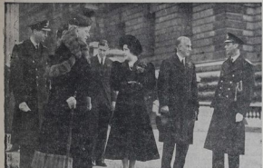
ARMISTICE DAY IN LONDON —The Royal party at the Clubhouse in Whitehall. From left: The Duke of Kent, Queen Mary, Her Majesty the Queen, the Duchess of York, the Princess the Royal.