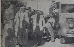
LIBERTY IN PALESTINE —British troops are still mopping up the terrorists. The photograph shows police searching Arab passengers and vehicles outside Jerusalem.