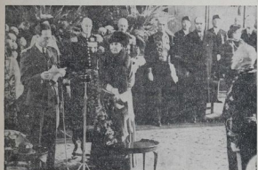
RELIQUARY KING VISITS HOLLAND —King Leopold and Queen Wilhelmina of Holland at a State ceremony in the Eusebius Hall at Amsterdam.