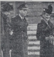
AT THE CELEBRATIONS —The Duke and Duchess of Kent with Princess Maria Louisa photographed after the Argentine Day ceremony in London.