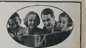
Of Course it's in the Daily Mail!

The film is being made into a film by the British Film Institute. It is a film being made into a film by the British Film Institute.