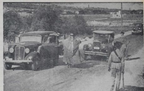
ON THE COASTS OF JERUSALEM —British soldiers inspecting motorists.