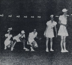
OVER-AND-OVER COMPETITION.—Waikato (Napier) team in the Hastings Inter-house Sports on Saturday evening.

THE DUKES MOTOR CO., LTD. DUNEDIN KAMBER ENGINE WORKS CO. LTD. Waiuku N.Z. DISTRIBUTORS: VOYER BROTHERS LTD., Wellington. Also at Auckland, Christchurch and Blenheim. FIRED WITH IMPROVED GENUINE CHRYSLER ALL-STEEL BODY