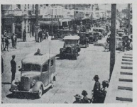
ARTILLERY REVIEW.—Artillery and equipment from Napier passing along Hastings Street, Hastings. The wireless car is in the foreground.