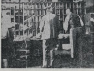
SORTING THE OUTWARD MAIL —Letters for delivery in other parts of the Dominion or overseas are carefully sorted into their postage.