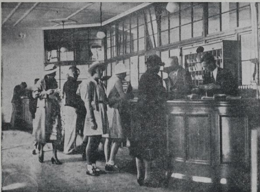
BEFORE THE HOUR BEGINS —Even in the early morning the Hastings Post Office is busy.