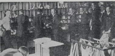
POSTMEN COLLECTING THE MAIL BEFORE DELIVERY TO THEIR INDIVIDUAL AREAS.