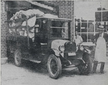
ONLY ONE LOAD OF MAIL —A Royal Mail van leaving the Post Office.