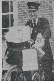
SERVICE WITH A SMILE —The postman waits on his friends, and is thankful in spite of the Christmas rush.