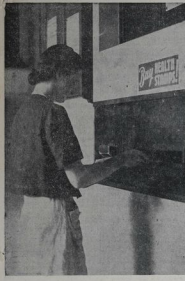
WHERE ALL THE WORRY BRINGS —The letter is slipped into the post slot, and the reader, unaware of its activity, probably does not give a thought to the wonderful procession inside the building.