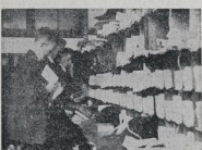
ALL IN THE DAY'S WORK —Postmen collecting letters before commencing their rounds.