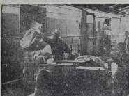
HIS MAJESTY'S MAILS —Loading the great mailbags on an express.