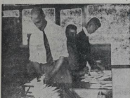
HOW THE POSTMAN GETS THERE —The answering machine at work on recently posted letters.