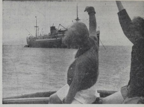
ALL REVUE —Young visitors working hard after a hour of inspection in the Waiwarana yesterday.