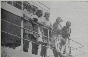
OUT IN THE BAY —These nightworkers had as tough a day as any working they were about to sail with the Waiwarana to England.