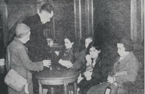
A SAFE REFUGIO IN KNOWLAND —Today, as in the past, the shelter of spruce work refuge under the British flag. The picture shows some of the crew who have fled from Germany to England in recent weeks. The children were taken from Germany to a holiday camp until homes were found for them in private houses or hostels.