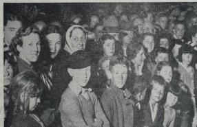
CAMP COMMUNITY SINGING —A section of the large crowd at the South Camp benefit concert at the Hastings water camp on Wednesday evening.