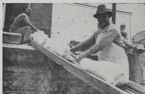
LOADING THE WAIWARANA —Hawke's Bay freight traffic being transferred from insulated trucks to the lighters at Port Tynes.