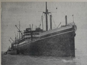
A SPLENDID PRODUCT OF BRITISH SHIPBUILDING GENIUS —The new motorship Waiwarana in the Tynes wharves.