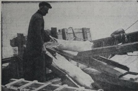
LOADING AT THE PORT —All arrivals are carefully checked as they shoot into the lighters for transshipment to the liner.