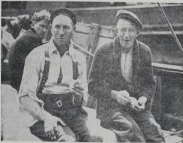
A HURRIED LUNCHEON PARTY —Port workers escaped on a lighter.