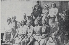
VISITORS TO THE WAIWARANA —Receiving a well-known Hawke's Bay crew, the Waiwarana is the subject of special interest to the people of the province.