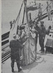
A CARGO OF HUMANITY —Lighters had on board the Waiwarana.