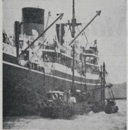
WAIWARANA'S MAIDEN VOYAGE —The three, David and Alton Company's new motor-boat liners about the day and lighters in the wharves.