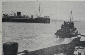
IN TOW —A view from a lighter approaching the Waiwarana.