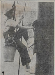
THE GIRL GUIDE MOVEMENT... BRIDGES FOR BRIDES