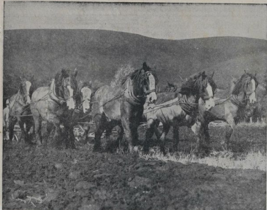
SPRING ON THE FARM. —A familiar rural scene that is never without interest to townsmen and country dwellers alike.