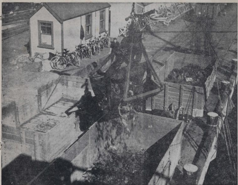
FOR HAWK'S BAY FIRES.—Unloading roof at Napier.