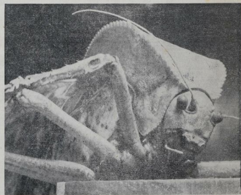
FACE TO FACE WITH A GRASSHOPPER—A magnified cleanup gives the impression of something between a giant horn monster and an oversized grasshopper.