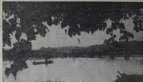
THE WANGANUI RIVER.—A glimpse of one of the loveliest reaches of a famous New Zealand waterway.