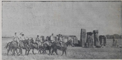
ONE OF ENGLAND'S MOST FAMOUS SPOTS.—Salisbury on Salisbury Plain, was the finishing place of a long-distance ride on horseback in which 200 riders from all parts of southern England covered 100 miles in three days.