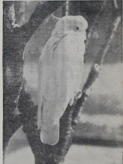
A HARTSPUR RESIDENT—A popular inhabitant of Corcovado Park.