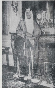
THE CROWN PRINCE OF SAUDI ARABIA. —Crown Prince of Saudi Arabia during his journey to London.