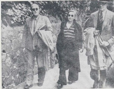
WORLD FAMOUS ACTRESS. —Elizabeth Bergner, the world famous actress, who is known to New Zealanders by her films, "Catherine the Great," "Kismet," "The Sign of the Cross," and the production of "The Two Faces of Eve," stopped in Napier, New Zealand, where she has been appearing in Shakespeare's "The Merchant of Venice." The photograph was secured under duress, as Miss Bergner declines publicity as much as George Gable himself.