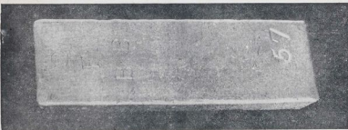
GOLD FROM THE SEA. —A bar of gold worth $250 which was recovered at this month ago from the wreck of the Swedish steamer Lathos, which was sunk on October, 1936, while carrying gold from the Bank of England to the banks of Hamburg.