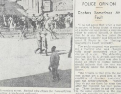
TRUCK IN PARADE—Buses from a Anniversary drive. Parked near the Government buildings.

Season Nearing End The season is nearing its end and the weather is becoming cooler. The people of Hastings are enjoying the autumn weather and are looking forward to the coming year. The season has been a very successful one and has been well enjoyed.