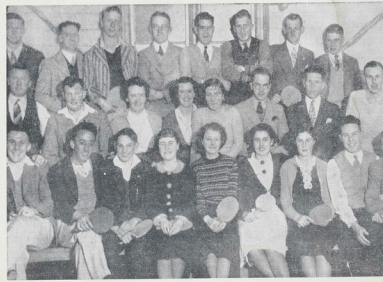
THE NAPIER TABLE TENNIS CLUB. —Members engaged at a club practice.