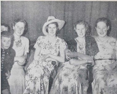
SNAPPED AT THE PARADE SCHOOL BALL.