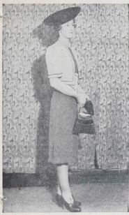
FOR STREET WEAR—A stylish ensemble suitable for street wear. The frock is of spun linen with backless marquisette, and is worn with a hat, pointed in a pale shade of blue and a lot of cream-blue summer delft.