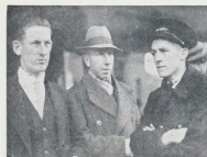
A WAYGOS SHARDON IN NAPIER.