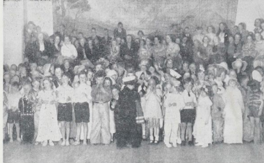
THE PARADE SCHOOL BALL—A "Daily Mail" photograph taken at Thursday's successful gathering.