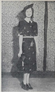
HATTER FASHION PARADE—A model frock of dark blue tulle, worn with American-made undergarments in an all-over design. The very smart hat of dark blue straw is in the picture below. Pattern under the skirt and having all trimming.