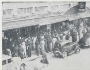
POPULAR ATTRACTION—A section of the street which watched the fashion parade in Gisborne. The parade was organized by a well-known buying club in cooperation with a theatre.