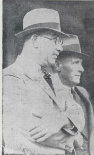
A SHARDON IN A HATTER BEHIND.