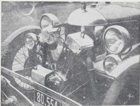
IN A NAPIER BEBE—An Aero Marine steam-wheel sports one of its type sailon one in Napier, (Small text about the boat)