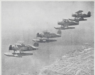
AMERICA'S DEFENSES - Landing airplanes form an important part of the United States coastal defenses.