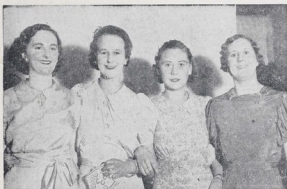
AT THE "FLASHLIGHT" BALL AT NAPIER ON WEDNESDAY.