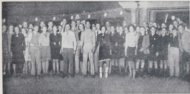
NAPIER SKATERS.—A "Daily Mail" photograph of the skaters on the Marine Parade on Wednesday evening.