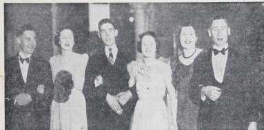
SNAPPED AT THE CHINESE RELIEF BALL AT HASTINGS.