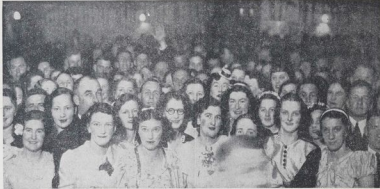
AT THE FLASHLIGHT BALL.—Some of the dancers at the Club and Restaurant Emporium's ball at Napier.