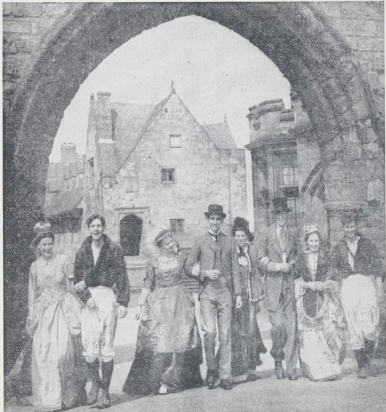
OLD ENGLAND RECREATED.—English School provides an authentic background for portions of the film "Smother, My Cup," which is being made in Hastings by an American company. The attractive girl above captures scenery through the school entrance on their way to lunch.