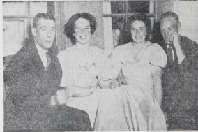
ANOTHER PARTY AT THE CHINESE RELIEF BALL AT HASTINGS.