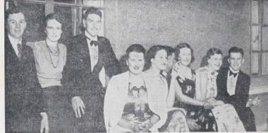
A POPULAR HASTINGS BALL.—Dancers at the Chinese Relief Children's Relief Ball on Wednesday.