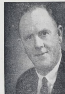
W. SULLIVAN, National Party Candidate for BAY OF PLENTY