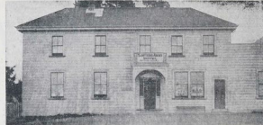
LANDMARKS AT TIROHIKO.—The school and hall at Tirohiko, centre of a rich Hawke's Bay sheep country.