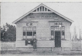
AT TIROHIKO.—The new material and post office.