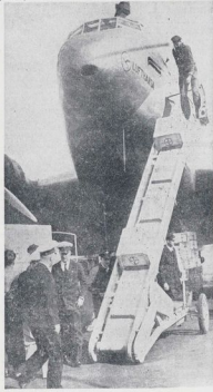
BOARD BREAKING GERMAN 'PLAVE'—See Gross Designer, which is now on the regular German air lines.