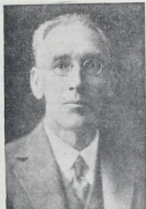
SIR ALFRED RANSOM, M.P., National Party Candidate for PAHIAHUA

THE NATIONAL PARTY STANDS FOR NATIONAL SECURITY!