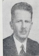
K. F. JONES, National Party Candidate for GISBORNE