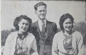
SNAPPED AT BRIDGE PA YESTERDAY.