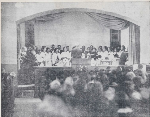
IN THE MORISON CHURCH AT BRIDGE PA.—The choir singing "Abide With Me" during the special service yesterday.