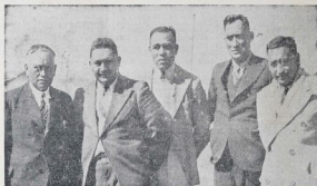
PERSONALIZES AT THE MORISON CHURCH SERVICE AT BRIDGE PA.