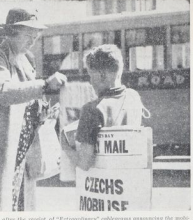
"DAILY MAIL EXTRA" - Illustration of the model of "Hawke's Bay" shown at the meeting of the Hawke's Bay Branch of the "Daily Mail" on the streets of Hastings on Saturday evening last.