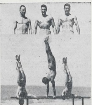
ON THE MARINE PARADE —Three members of the Napier M.C. Club, pose for the "Daily Mail" cameraman yesterday.