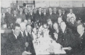
FIRE BRIGADE DONOR —The 10th Fire Brigade welcomed by Honorable Alderman with a dinner held in the Empire's Hall, at Port Albert on Saturday evening.