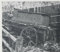
A DELIC —The old "Mosaic" which was presented to the 10th Fire Brigade by Guinness and Co., was here on the Empire's grand at Port Albert.