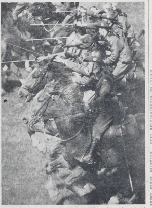
260,000 GER.—A quality charge of 260,000 soldiers, near Malbork, where members of the 1st Infantry Division have been sent on a 'tea day' course.