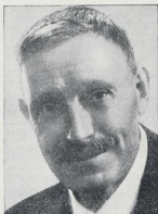
The Hon. Adam Hamilton THE NATIONAL LEADER

The National Party is pledged to serve the vital interests of workers... farmers... everyone in the community... regardless of party, class or creed. It will bring into force a policy that will restore personal freedom, maintain the highest standards of family life, and give a fair deal to the farmer, the manufacturer and private enterprise. Housings for the people to own, free maternity service for all, universal superannuation for all men and women, lower radio licence fees and patrol tax... these things WILL be done as part of the progressive National policy. There will be no cuts in wages, pensions, or Civil Service salaries. Safeguard your rights—and your future—by putting the National Government in power.