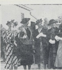
AT THE WATERLOO MEADOWS.—A happy group staged outside the church after the ceremony.

The fourth grade rugby match between M.A.C. and High School was played on Saturday afternoon at the Hastings Cricket Ground. The match was a close one, with M.A.C. winning by a narrow margin.