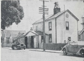
THE 10TH FIRE STATION AT PORT ALBERT —This building was erected in 1917.