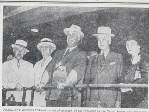
PRESIDENT ROOSEVELT—A crowd photographs at the President of the United States, who was present on an important part in the circus in Napier.