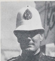
BRIM OF SUMMER —Firemen ahead over to their summer job activities.