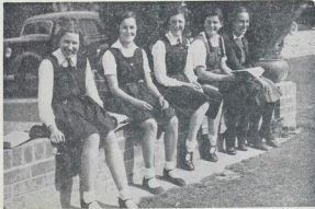
SMILES FOR THE CAMERA —Work stops and the girls forget their books while the shutter clicks.