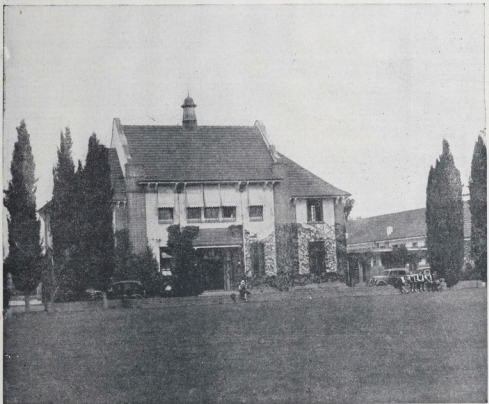
THE HASTINGS HIGH SCHOOL —This photographic study shows the beauty of a modern school.