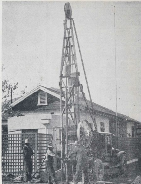
SUPPLEMENTARY WATER SUPPLY —An artesian bore being sunk at Clive Square, Hastings, to augment the council supply for use during the summer months.