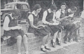
LESSONS IN THE SUN —These girls at the Hastings High School were busy at their studies with one eye on the photographer.