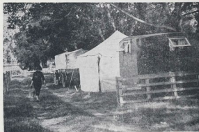
PREPARING FOR THE SNOW —Several addresses nearby have already made their appearance of the Tenters about previous.