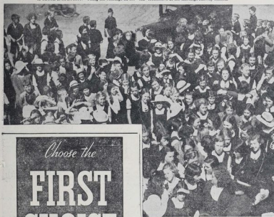
THE REHEARSAL CROWD—This group of children engaged outside Napier's Municipal Theatre yesterday, comprise only a small section of those taking part in the Napier school Festival which is being produced in the theatre tonight and tomorrow.