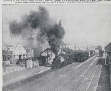
MID-DAY AT THE HASTINGS RAILWAY STATION—Angry clouds of smoke the Napier-bound train departs.