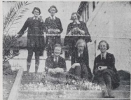
"FROM GRATE TO GRAY, FROM LIVELY TO SEVERE"—A study in "total school" expression at Iona College.