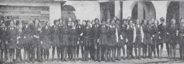
PUPILS FROM IONA COLLEGE AND WOODFORD HOUSE.