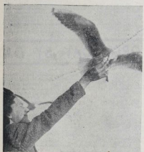
A remarkable picture of a swan in flight actually feeding from the hand of a spectator in Kensington Gardens, London.