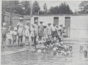
Swimming is popular with the children during the hot weather and St. Luke's School, Hastings, caters for the demand with a special swimming basin on its premises. It is one of the more popular features of the school.