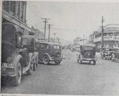
Recent complaints to the traffic inspector regarding frequent parking in the main street of Hastings are countered by this snapshot obtained by the "Daily Mail" cameraman yesterday. A general appeal is being made to the motoring public to assist the authorities by observing the parking regulations.