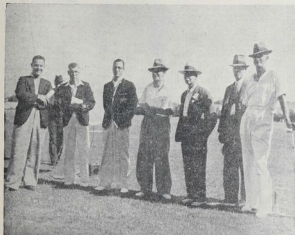
Judges and timekeepers at the annual Hawke's Bay Athletic Championships held at McKean Park, Napier, on Saturday. The conduct of the meeting was a credit to the officials concerned.