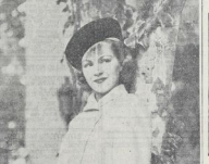
By Ginger Rogers