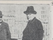
AMENITY FOR POLITICAL PRISONERS IN AUSTRIA—The former Ambassador and Minister in Athens, Sir Robert Buxton, is seen here in a discussion with other members of the House of Commons.

The debate also touched on other foreign policy issues, including the situation in the Middle East and the possibility of a new world conference. The Liberal Party called for a more active role for the Dominions in international affairs.