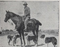
WETTER BENEFITS NEW PROBLEMS AND ENTIRELY MAN-MADE —Groom with a horse and often with a blood-wind dog and horse play their part in the handling of stock. At every stock sale, the shepherd, his horse and dog are in the front. A snap at Stifflehead Lease yesterday.