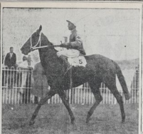
English bred a long run of sinner plodgers who also won the Green...

Government... Government... Floodie has resumed regular training.