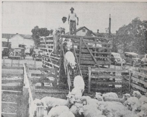
"RECOVERED AT THE DOOR" —Two of thousands of sheep a season reach such and are handled in just such a method as this might be the "Dolly Head" yesterday at Stifflehead Lease.