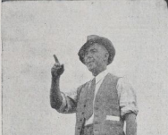
"I'LL TAKE A PENNY, BUT GENTLEMEN, I AM UNHAPPY" —I thought these sheep would have made more!—The auctioneer Dixon's chief loss here this morning is the favour shown of the popular partners of the auctioneer. It is an historical selling method, and in the past, the auctioneer and auctioneer often showed. This is a method and Dixon is only caught at Stifflehead Lease yesterday. The auction is for a block of 1000 sheep.