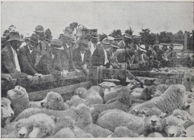
THE WATCHERS—AND THE RIDERS —A typical view of the sheep section of yesterday's sale at Stifflehead Lease. A group of farmers beside the pens following the sale.