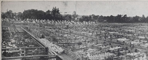
THE SPREAD OF STIFFLEHEAD LEASE, ONE OF NEW ZEALAND'S LEADING STOCK MARKETS. —A general view of the Stifflehead Lease taken yesterday during the weekly market. Backing as one of the leading markets of New Zealand and extending to the North Island, great interest and important activities in this provincial stock exchange. In this photograph taken from near the refreshment rooms, the cattle pens are on the left, the sheep pens on the right, the foreground, while the fat sheep pens are on the far side of the parade.