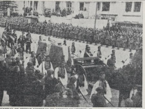
FEDERAL PRIME MINISTER OF GREECE IN ATHENS—The group passing through the streets of Athens. Also George of Greece, the Duke of Aosta, Prince Fred and Prince Ferdinand are seen immediately behind the horse.