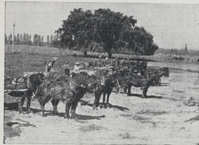
Many teams are engaged at present building a step-back to protect orchards in the Hastings area from flooding. This is part of the Hawke's Bay Rivers Board programme.