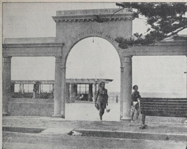
WORK ON MARINE PARADE —Great interest attaches to the improvement work on the Marine Parade, Napier. It has been decided by the Napier City Council to extend the railway formation shown in the photograph. This shaped gives an excellent example of the beauty in the lines of this section of the work.