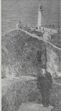
POSTMAN CLAIMS A MONTHLY SIX TIMES A WEEK—14