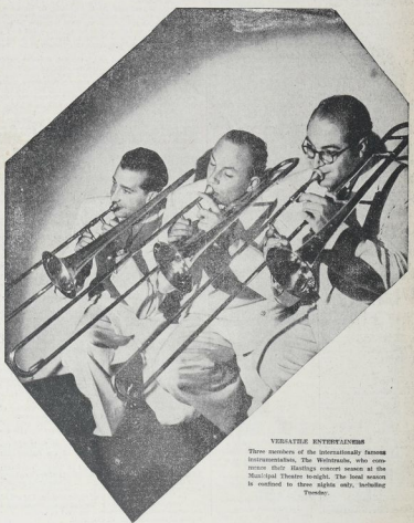
VERSATILE ENTERTAINERS Three members of the internationally famous instrumentalists, The Holmsteins, who comprise their Hastings concert series at the Municipal Theatre tonight. The local season is confined to three nights only, including Tuesday.

both refreshingly better - - the NEW popular daily paper the OLD favourite family TEA BELL TEA