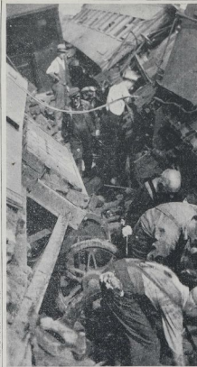
FACING THE FORWARD'S TASK OF CLEARING THE TRACK—Bullerstown served with modern equipment for clearing, watering, and mowing the track at Hawke's Bay.