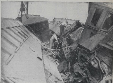
AN ALMOST INVINCIBLE TANGLE AT THE CENTRE OF THE SMASH —This photograph gives a graphic view of the central scene in the railway disaster which occurred at Eureka in the early hours of Sunday morning. The twisted and mangled metal of the carriage frame in the early hours of Sunday morning. The wreckage was left in a tangle, and as the engine and one carriage remained on the track on the left the following carriages burst their way through a traffic which which left this V-shaped gap in the bed of the cutting.