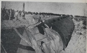
THE ROOF OF THE WRECKED CARriage REACHES THE TOP OF THE CUTTING —Taken from the left of the cutting as it was approached from the north, the engine and following carriage being against the bank. Passengers were trapped on the bank side.