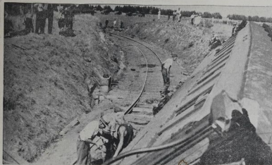
THE FATAL BEND ROUND WHICH THE TRAIN SWUNG TO DISASTER —This photograph gives a clear impression of the railway track leading into the point of the actual crash in the cutting. The train was travelling north, and the photograph was taken looking south.