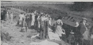
IMPROMPTU FIRST-AID ARRANGEMENTS ON BANK —Fortunately there was one doctor on the train and with the aid of willing assistants the injured were rescued and carried to the top of the cutting for attention. Pillows, seen in the foreground, mark the spot where first aid was rendered.