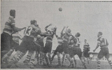
EXPECTANT FORWARDS IN A LIVE-OUT INCIDENT IN THE M.A.C. TECHNICAL RUGBY FOOTBALL MATCH PLAYED AT McLEAY PARK, HASTINGS, ON SATURDAY.—These four players are the players in the foreground, and the match was aptly followed by a large crowd.