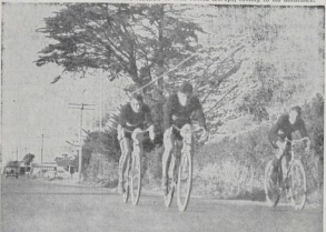
RACE-MAKERS SPEEDING UP.—The Gravelite club's 75-mile road race at Taradale on Saturday, when an exciting race was seen just four times was recorded.