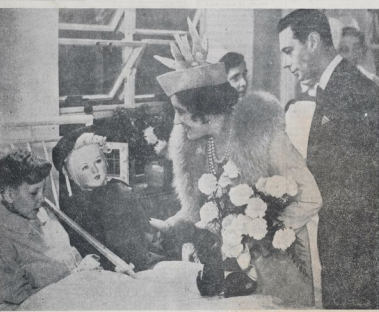
A CALL BY THE KING AND QUEEN —An official photograph of their Majesties, before leaving a visit to the new buildings of the Hospital for Sick Children, Great Ormond Street, London.