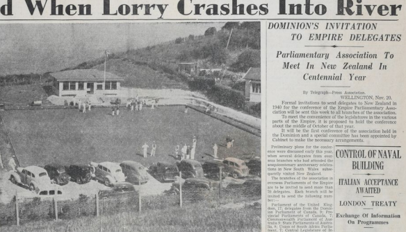
THE GREAT ON THE HILL.—The Big Red Bunting Club's new green situated high above Napier's Domain, is probably unique in the Dominion.

The lorry was carrying a load of ammunition, and was driven by the lorry driver, who was seriously injured. The other eight men were also injured, and some of them were seriously injured.