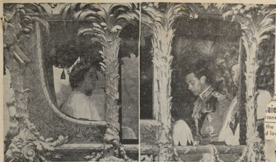
THE KING AND QUEEN IN THE STATE CHAIRS.—Two remarkable photographs of their Majesties as they drove from Buckingham Palace to Westminster to open the new session of Parliament on November 8.