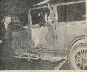
WALL, ACTIVITY YEAR EARLIER.—A scene seen on hillside and another actually behind when the photograph on which they were today collected with a motor-car last evening. The car had been at the entrance of the road and the hillside.

By The Associated Press WASHINGTON, Nov. 24. — Modern road-making machinery is in use on the construction of the new highway through the Spanish Sahara. The machine was inspected today by the Prime Minister, Mr. Neville Chamberlain and several Ministers.