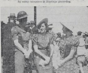
SNAPSHOTS AT THE HASTINGS RACES YESTERDAY.