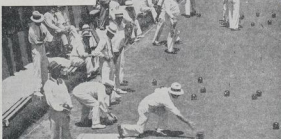
NEW YEAR BOWLING TOURNAMENT AT NAPIER. —Forty-four clubs are taking part in the New Year tournament at the Napier, Port Arthur, Waikato, and Otago bowls clubs. The picture was taken at Napier.