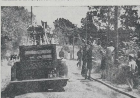
GRASS FIRE IN NAPIER. —The Napier Fire Brigade was called to a grass fire on Hastings Hill early on Saturday afternoon. The brigade had the blaze under control very quickly, and no damage was done.