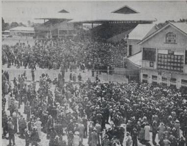
POPULAR RACE MEETING AT HASTINGS. —Part of the enormous crowd which attended the first day's racing yesterday.