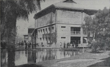
AT THE HAWKES BAY JOCKEY CLUB'S RACECOURSE AT HASTINGS —Looking across the lake to the grandstand.