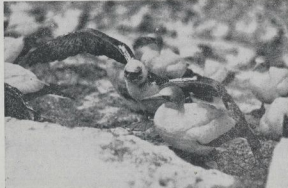
FIRST LESSONS —A young gannet undergoes instruction in flying.