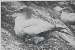
OUT OF HAREN'S WAY —A holy nestling snugly under mother's wing.