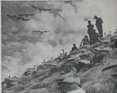
BOARING OVER THE COLONY —Four gannets outlined against the light clouds of summer.