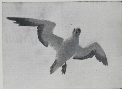
TWO MAGNIFICENT STUDIES OF GANNETS IN FLIGHT.