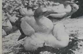
ALMOST BIGGER THAN MOTHER —Before taking its first flying lessons, a young gannet snuggles close to its mom.