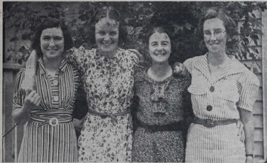
GET OF SCHOOL.—Four teachers at the Summer School now in session at Napier.