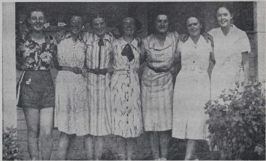
A SNAPSHOT AT THE TEACHERS' SUMMER SCHOOL AT NAPIER.