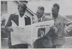
AN EARLY MORNING BROWSE AT THE TEACHERS' SUMMER SCHOOL.