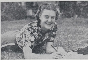
WRITING HOME.—Another Summer School snapshot.