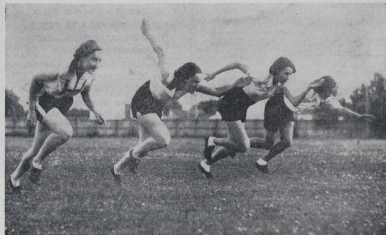
THE START.—Starts girls athletes training at Nelson Park.