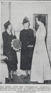
THE BRIDE, WITH MR. CHAMBERLAIN, EXAMINING A QUALIFIED BREWING COURSE...