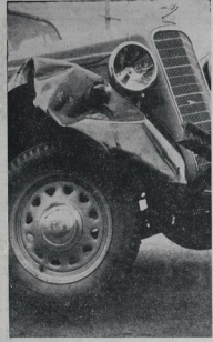
THE OTHER CAR. —It was with this car that the vehicle which made a spectacular entry into the "Daily Mail" office on Saturday exhibited the curious fault—damaged head lamp.