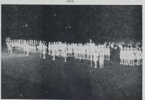
IMPRESSIVE DISPLAY AT NAPIER. —The South Island Inter-town Championship teams at McLean Park on Saturday evening.