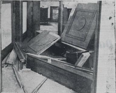
FROM ANOTHER ANGLE. —Plenty of doors, hinges, door-pulls and other pieces piled against the counter in the "Daily Mail" vestibule. Pieces of timber were found across the counter, one of them striking a girl's coat.