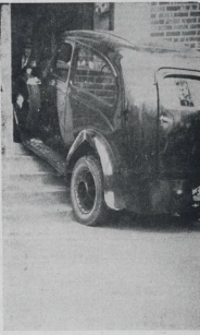
COMING OUT AGAIN. —In spite of the steadiness of the weather, the "Daily Mail" is now able to present a photograph of the car in the act of leaving and the office on Saturday afternoon. The car, however, was taken in the height of the excitement, when the massive car being removed from the office.