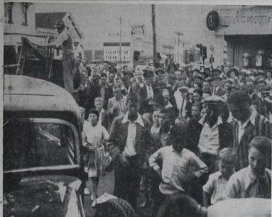
ELECTION NIGHT AGONY. —When a hawker has called the "Daily Mail" vehicles with a massive attached handful of people on Election night. The photographs were taken after the car had been removed from the office. From 1 p.m. until 2.30 the largest crowd since election night thronged the "Daily Mail" offices.