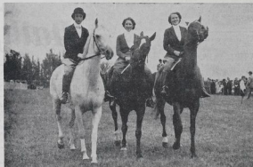
A CHARMING TRIO.—Women competitors at Waipahoa.