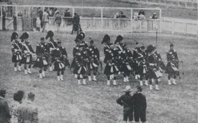
THE COLOUR AND RHYTHM OF THE HIGHLANDS.—The Waipahoa Highland Pipe Band in action give a very striking showman's display at the Waipahoa Show.