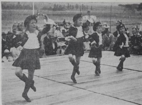
THE HIGHLAND FLING.—Four distinctive dancers at Waipahoa.