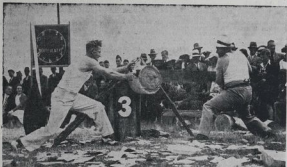
A HUMAN SAWMILL.—Two competitors in the Helmsley race, double-handed rowing contest at Waipahoa yesterday.