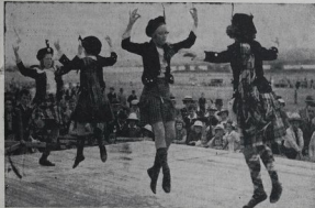
THE BEEL O' TULLOCH.—Some of the competitors in the dancing events at Waipahoa.