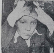
CONCENTRATION —A study of the London 'Bog' Class Championship.