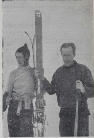
WINTER SPORTS AT ST. MORITZ —The Coast and Counties Touring at Corvatsch. The Cousins in the sister of B.H.R. the Duchess of Kent.