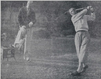
THE DUKE OF WINDSOR AT GOLF —The Duke makes a drive, watched by his famous golfer, Archie Compston. This photograph was taken at the Royal course, Old St. Andrew's.