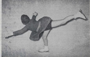
ICE BALLET REVEALED —One of the skaters of a rehearsal for a grand display at Drayton, London.