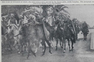
PARADE IN TUNIS —Men of the famous French Armée moved on impressive part of the procession in honor of the visit of the Prince of Monaco (H. Bonaparte) in Tunis.