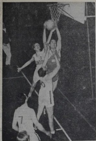
BASKETBALL IN LONDON —They round the London goal in a match against visiting Americans.