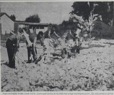
WOOD-DRIVING WORK YEAR CLIVE. Six-hundred workers in the field near a large wood-working works. The wood, spread on tracks in the foreground, is being taken to a sawing mill. It will have the usual marks caught the various formations of the forest wood in the forest.

Index to Today's LEADING ARTICLES... SHIPPING... INTERNATIONAL NEWS... TREATIES... WOMEN... CORRESPONDENCE... 121