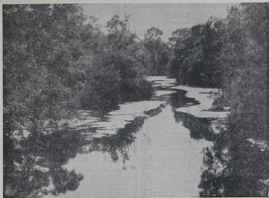
A QUIET SCENE NEAR ONE OF THE DOMINION'S BUSIEST HIGHWAYS —A view of the Kawara Creek from the Napier-Hastings Highway.