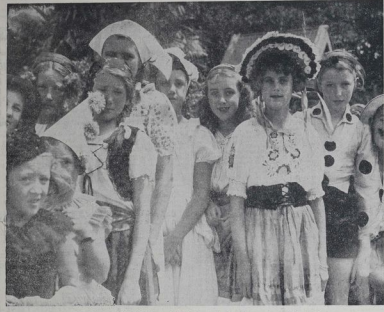
CHILDREN'S PARADE IN NAPIER. —Some of the children in the fancy dress parade on Wednesday afternoon.