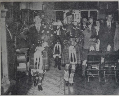
BURN'S 75TH CELEBRATION AT HASTINGS. —The ceremony of giving in the hedges of the 75th anniversary of the Hastings and District Girls' Society.