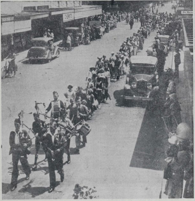
PIED PIPERS IN NAPIER. —The colourful procession of children in fancy dress parading along Pitt Street. The children were the guests of the Napier Youngsters Club at a meeting at the Plaza Theatre.