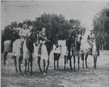
ANOTHER MORNING'S WORK IS OVER—A group of horses cooling off near the willow trees at Hastings after their work-outs on the track yesterday morning.