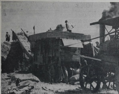
GRASSMENDING AT MANAWATU—A mill and engine hard at work.