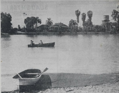
THE SUCCESSOR TO THE BARK HUT OF THE PIONEERS—A station homestead situated on a hillside at Goodwood, Hawke's Bay.