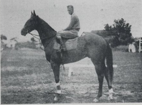
GOUGE BACK CUP WINNER—Morning Photo, with the Gouge Back Cup in alternative style at Hastings last week.

Lucky Values MANCHESTER BARGAINS Top the Scale at Bedrock Prices! FURTHER B.M.L. SALE SNIPS!