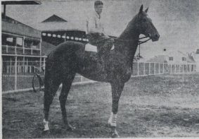
ENGAGED AT WAIROA—The standing jockey riding Franconi, who looks bright and well in view of his engagements at Wairoa this week.

Back to school the children go to look smart and to please the teacher and their school mates. The clothing is what counts, and the best is what you get at Westerman's. We have the full range of children's school clothes at the lowest prices. BOYS' SCHOOL WEAR — PYJAMAS— TOUGH WEAR NAVY SHORTS— Durable, All sizes. Price ... 4/11 HEAVY BROUGH SERGE NAVY SHORTS—Durable wear. Price ... 8/11 NAVY OR GREY FLANNELS— Durable. Price ... 4/6 to 8/11 BENEFIT WEIGHT SINGLET'S— Price ... 8/6 to 12/6 to 14/6 SINGLET'S—All wool, fine quality. Price ... 4/6 to 8/11 BELTS—For all schools. Price ... 1/6 each Price for all schools. Price ... 3/6 each STENOGRAPHERS' SCHOOL BROS.—All sizes. All sizes. Price ... 3/6 each FANCY TOP HOSE in Two Tones. Brown and Grey. Price ... 3/6, 5/11, 8/6 WESTERMAN'S HASTINGS