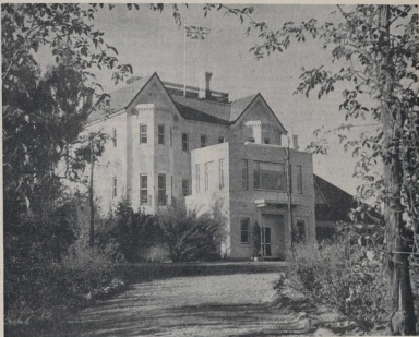
TO BE THE HOME OF ROYALTY. —Government House, Otago, where T.B.M. the Duke and Duchess of Devon will live during the Duke's term as Governor-General of Australia.