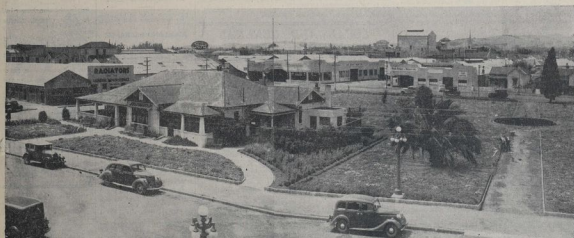
HASTINGS CIVIC SQUARE. —Although there has been some controversy over the proposed rebuilding of the Building Club Square, the general rebuilding of the Building of particular makes a brilliant scene.