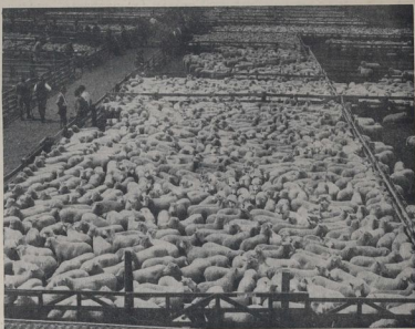
BIBB PAIR AT STURTFOUR LODGE. —A general view of the pens, showing some of the 18,000 sheep parked.