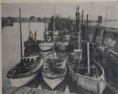
ON THE PORT ASHURTON WATERFRONT. —A picturesque scene reminiscent of English fishing towns.