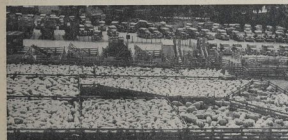
THE DAY AT STURTFOUR LODGE. —Long lines of memorabilia parked behind the crowded pens, a scene of yesterday's eve fair.