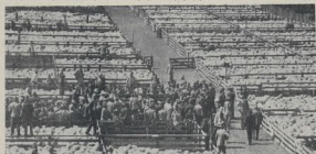
THE WEALTH OF HAWKE'S BAY. —Thousands of sheep at Sturtford Lodge. The scene at the commencement of the sale yesterday.