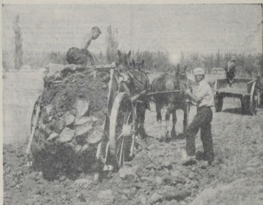
LOAD AFTER LOAD. —A picture which gives a good illustration of the way in which the Hawkes Bay River stopbanks are being built up under the direction of the Bay Rivers Board's scheme.