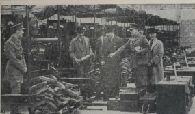
INSPECTION OF LONDON'S DEFENCES. —The War Minister (Mr. E. L. Ebbes) inspecting search-light gunners at one of the many mobilization areas in London.