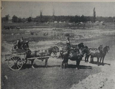
FLOOD PREVENTION WORK. —The men on the Hawkes Bay River banks, where throughout the day an endless chain of drags is depositing loads of spoil to build up the banks.