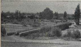
BRIDGE TO BE IMPROVED. —The Redcliffe Bridge across the Palmerston River, near Torowhe. Work has begun on the construction of a new approach to the bridge.