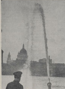
PREPARED BY THE PRESS—Turning out in line for the Thames at Bishops Cleeve.