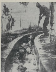
NECESSARY, BUT UNPLEASANT. —Profiting along being stopped on Bushmore farm.