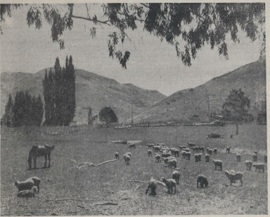
SUMNER PASSEAU.—A Special Reserve's Bayonet race, this time near Bridgton, Pa.