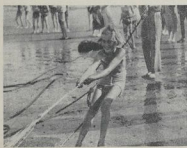
BRUISING IN THE NET. —Young fishermen at Westshore, Napier.