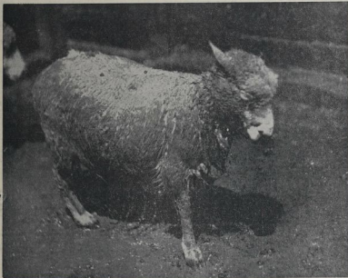
BAAL —This photograph might be entitled "A Picture of Mystery."