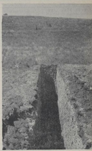
DRAINAGE TUNNEL. —The waters of the lake are drained through this tunnel, which has been bored for more than 100 feet through the hillside.