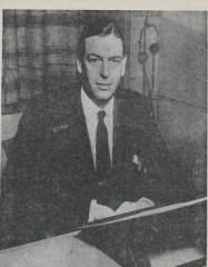
THE PICK OF KENT. —H.B.R. the Duke of Kent photographed at Broadcasting House, London, on January 29, when he spoke to Australia.