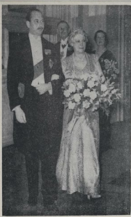
ST. BARTHOLOMEW'S HOSPITAL APPEAL. —Mrs. the Countess of Gloucester escorting Lady Bicester (the Lady Magress of London) into the hospital hall at the Museum House. The entrance was the St. Bartholomew's Hospital appeal dinner.