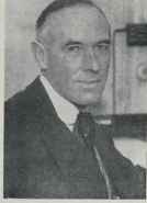
NEW BRITISH DEFENCE MINISTER. —Arrival of the Earl of Halifax, the new Minister for the Coordination of Defence.