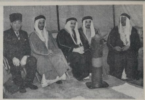
MUSLIM (GEMMOT) IN ENGLAND. —Some of the Arab delegates to the Palestine Conference in London seated the Chairman (Jung of the Arab Army, British). The occasion was the celebration of the festival of 'Idd-ul-Fitr.