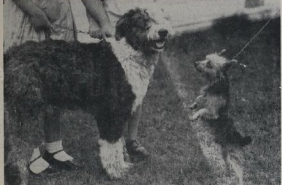
"HAVE YOU BEEN INOCULATED, TOOP?" —Two arrests at the Beach's Dog Show yesterday, when dogs were inoculated against distemper.