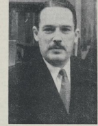
BRITISH CANNON CHANGES. —Major Sir Basil Brock, Director-General, the new Minister of Munitions.