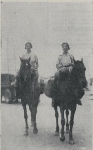
AN UNUSUAL SIGHT IN 1937. —Two horsemen in Hastings yesterday. They are Hastings people who will on their way home after visiting a horse show at the North Island.