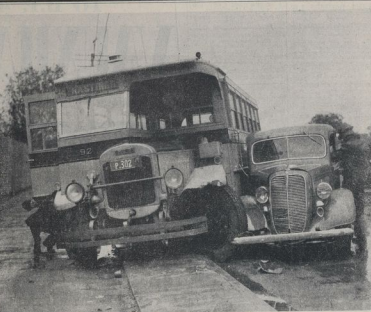
SPECTACULAR ACCIDENT IN HASTINGS.—A motor-car was involved in an accident in Ewens Road, Hastings, yesterday. No one was injured.