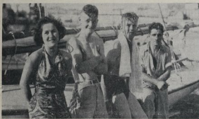
A FINE AFTERNOON IN A SPOT.