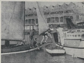
WHITE SAILS AND CALM WATERS. —A scene in the boat harbor at Port Arthur.