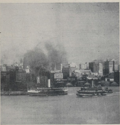
CANADIAN QUEEN.—A view of Canadian Queen with port of her motor installed since in the background. A contract is now under way for the reconstruction of the Canadian Queen waterfront.

This competition will be run weekly under the auspices of the Super Racing Association, and will appear in Saturday issues of the Hawke's Bay Daily Mail. All you have to do is to provide a reply to the question as depicted in the cartoon. For example: "The boy should have a medal for his reply." The reply should be sent to the Editor, Hawke's Bay Daily Mail, c/o the Editor, 100, Victoria Street, Hastings, New Zealand, and accompanied by stamps to the value of 5d, or postal note covering the number of entries. Address your entries to P.O. Box 171, Napier and mark your envelope "What is the Reply" Competition No. 1. PRIZES 1st PRIZE .. .. . 5s 2nd PRIZE .. .. . 2s 3rd PRIZE .. .. . 1s 4th PRIZE .. .. . 1s 5th PRIZE .. .. . 1s Prize winners will be published each week in the advertisement containing the succeeding competition. All entries must bear the postmark not later than the Tuesday following the competition. Prize money will be increased in accordance with the entries received, and in proportion. The Judge's decision is final, and no correspondence will be entered into with regard to this competition.