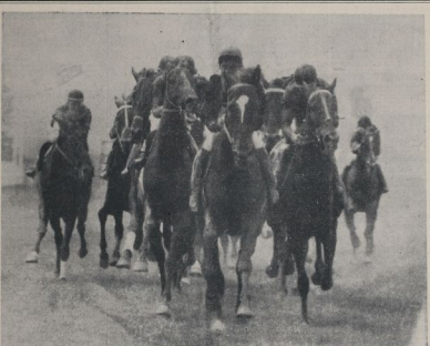
PULLING HARD IN THE LEAD. As the field opened post the results for the first time in the Woodville Handicap at Woodville proving the situation winner, the Dapper Skip, Lady Fane, was pulling hard in the lead from Master Cyclone and Silver River, with the Gold web leading.

Index to To-day's News LEADING ARTICLE... LOCAL NEWS... NATIONAL NEWS... PROVINCIAL NEWS... THEATRE... WEATHER... CHILDREN'S PAGE... POKING... RECORDED ANSWERS