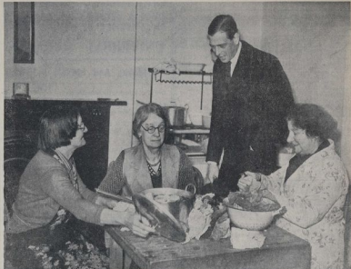
ROYAL INTEREST IN SOCIAL WORK.—H.H.H. the Duke of Kent, who is a member of the National Review of Social Service, visits the Palace following for the Christmas.