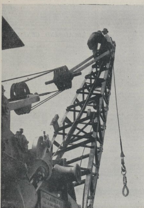
A PERILOUS FEAT.—One of the cranes on the smaller crane which is being used on the bridge construction job at Manawatu. The old bridge was pulled down and the new steel structure was erected in twenty in less than 22 hours, a notable achievement.

ANOTHER Sensational B.M.L. Value Opportunity for Ladies . . . at the B.M.L.