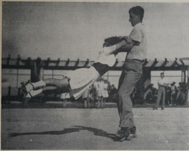
CELEBRATING "KEEP FIT" WEEK IN HAWKE'S.—Roller-skaters on the Marine Parade.