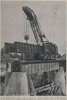
TO PROCEED TO THE GRAVE. A view of the work in progress on Doncaster's new railway bridge. The 31st steel girder is being swung into place by a large crane...

Index to To-day's News LEARNING ARTICLE... SPECIAL NEWS... CLASSIFIED ADVERTISEMENTS