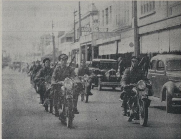
ON ROUTE TO CAMP.—A motorcycling column from Oltarua photo-rolled on they passed down Mervyns Street, Hastings, yesterday while travelling to the military camp at Wairoa.