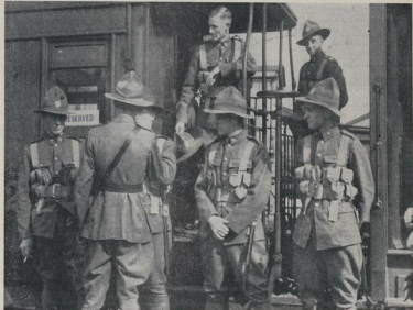
A BROWN RECRUITMENT OF (P.P.S.)—Hastings volunteers leaving for the military camp at Wairoa.